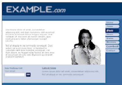
Figures 5, 6, and 7: First impressions are often made based on the color scheme.

Which sells the most/least expensive goods?