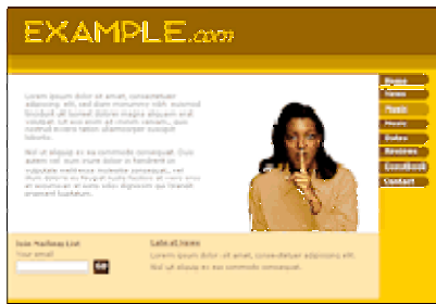
Figure 9: Reducing saturation can have a warming effect.