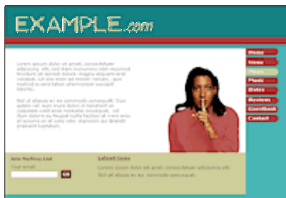
Figure 8: Increasing saturation can widen a palette's appeal.

Some color combinations appeal to one segment of the market pretty much exclusively. For example, the unsaturated palette used in our first example is generally perceived as being a feminine one— suited to a site selling beauty products, but not, perhaps, to one selling men's clothing. A version using similar but more saturated colors results in a look that will be broader in its appeal.