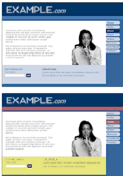
Figure 10: Adding red and yellow add warmth to blue.

Blues in combination are known to project a businesslike and authoritative feel, so it's no accident that blue, in various hues, is ubiquitous on big business sites. However, used alone, albeit in various shades, blue can appear cold, conservative, and unapproachable. The addition of red and yellow brings warmth and dynamism to this color scheme.